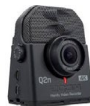
The Zoom Q2n is a popular and high-quality audio/video recording device and is perfectly suitable for prescreening videos.